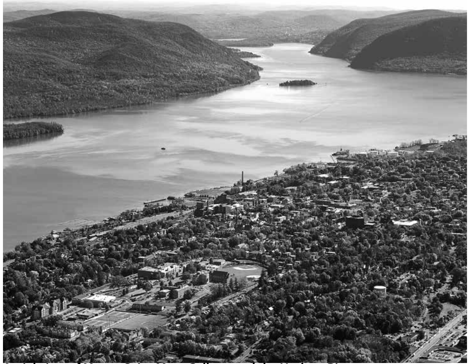
Aerial view of Mount Saint Mary College and the Hudson River.

Guzman Hall , built in 1963 and recently renovated, is a multipurpose residence hall that also houses Founders Chapel and the Health and Wellness Center.